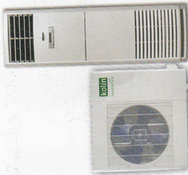
KFM-400GF1INV / KFM-700HF1INV